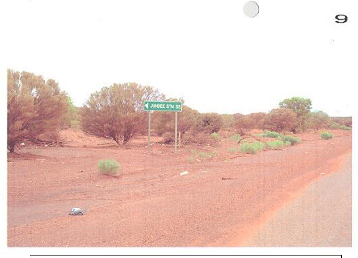
Figure 2: Exhibit "1" tab 61 no. 9 depicts the signage to Jundee Station