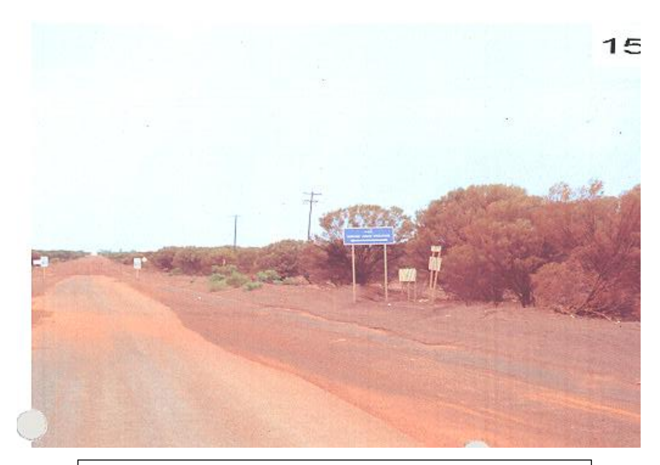
Figure 3 : Exhibit "1" tab 61 no. 15 depicts the blue signage erected by the Council along the Gunbarrel Highway directing traffic towards the Jundee mine site