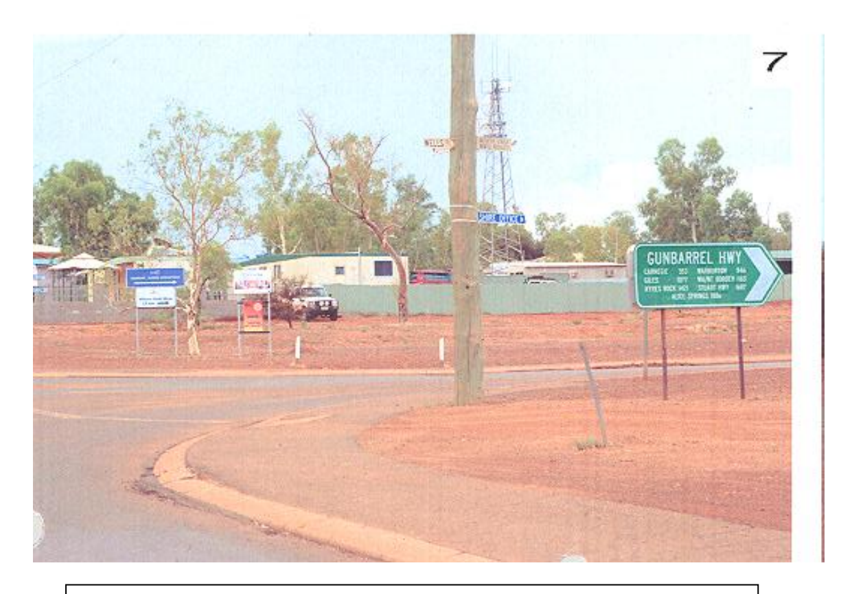
Figure 1: Exhibit "1" tab 61 no. 7 depicts the signage at Wiluna township