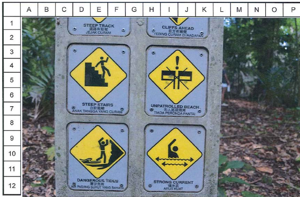
Exhibit 5, Page 7 – Close-up of sign at entrance to Winifred Beach walking track