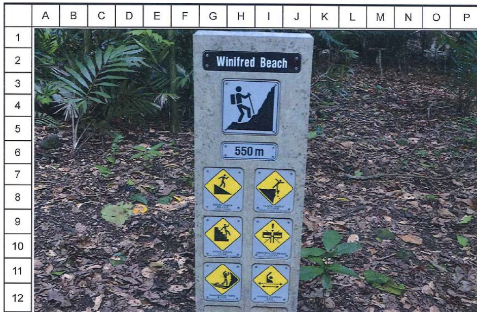
Exhibit 5, Page 6 – Sign at Winifred Beach carpark, at entrance to walking track

35. Signs are erected at the commencement of the marked walking trail to Winifred Beach, and again at the top of the steep aluminium staircase, warning people of the hazards ahead.