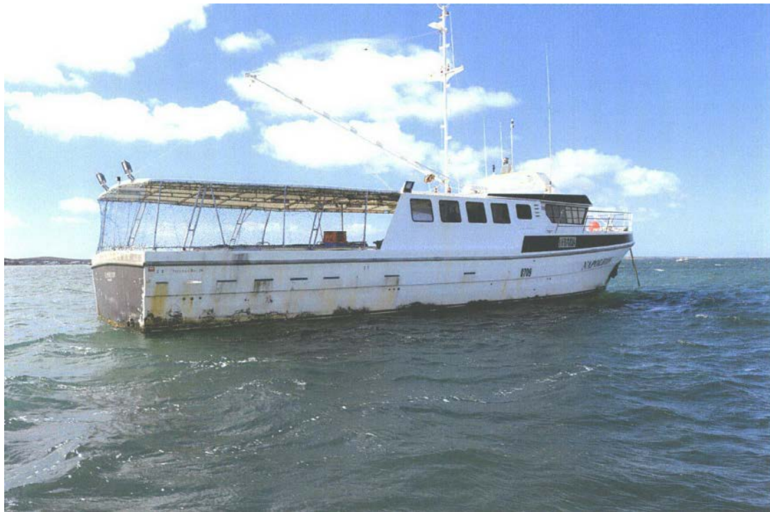
Exhibit 1, tab 4, Page 1 – Napoleon Vessel

The deep sea crabbing vessel upon which the deceased was a crew member was the 'Napoleon'. Its registration number was LSBG124 and its unique identifying number 5116.