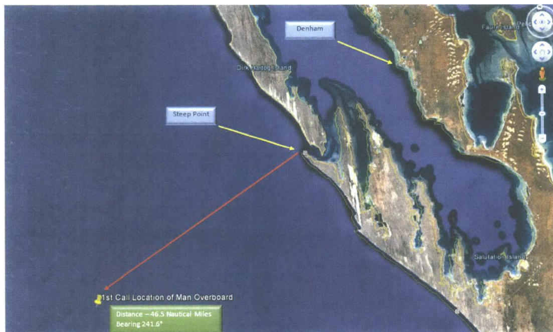
Exhibit 1, tab 3, page 5 – Figure 2.1 – Google Extract – Initial Report Location – Man Overboard Luke MURRAY