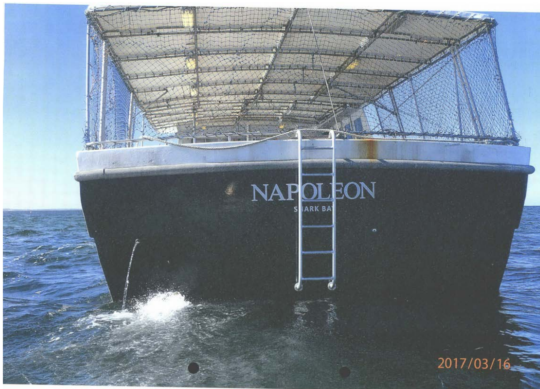
Exhibit 1, tab 18, Photograph 7 – Napoleon Vessel – back end looking forward.